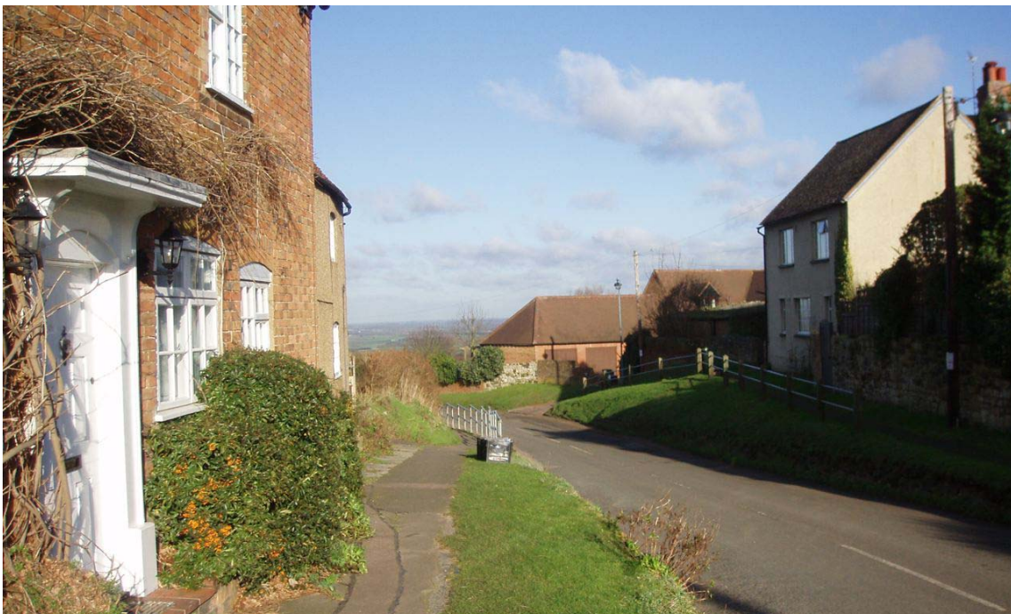
The village of Brill is on the very top of the hill.

The area has a distinctive character with a strong sense of historic continuity from the good hedgerow pattern and historic settlement of Brill, the windmill is a notable landmark with strong historic associations. Overall the sense of place is considered to be moderate. The very strong landform with steep slopes and intermittent tree cover produces an area of high visibility. The overall degree of sensitivity is high being particularly strong in Brill and around the edges of the settlement.