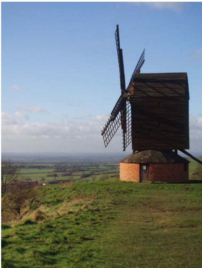
Brill windmill a fine example of a postmill dating from the 1860's with fine views west out over Oxfordshire.